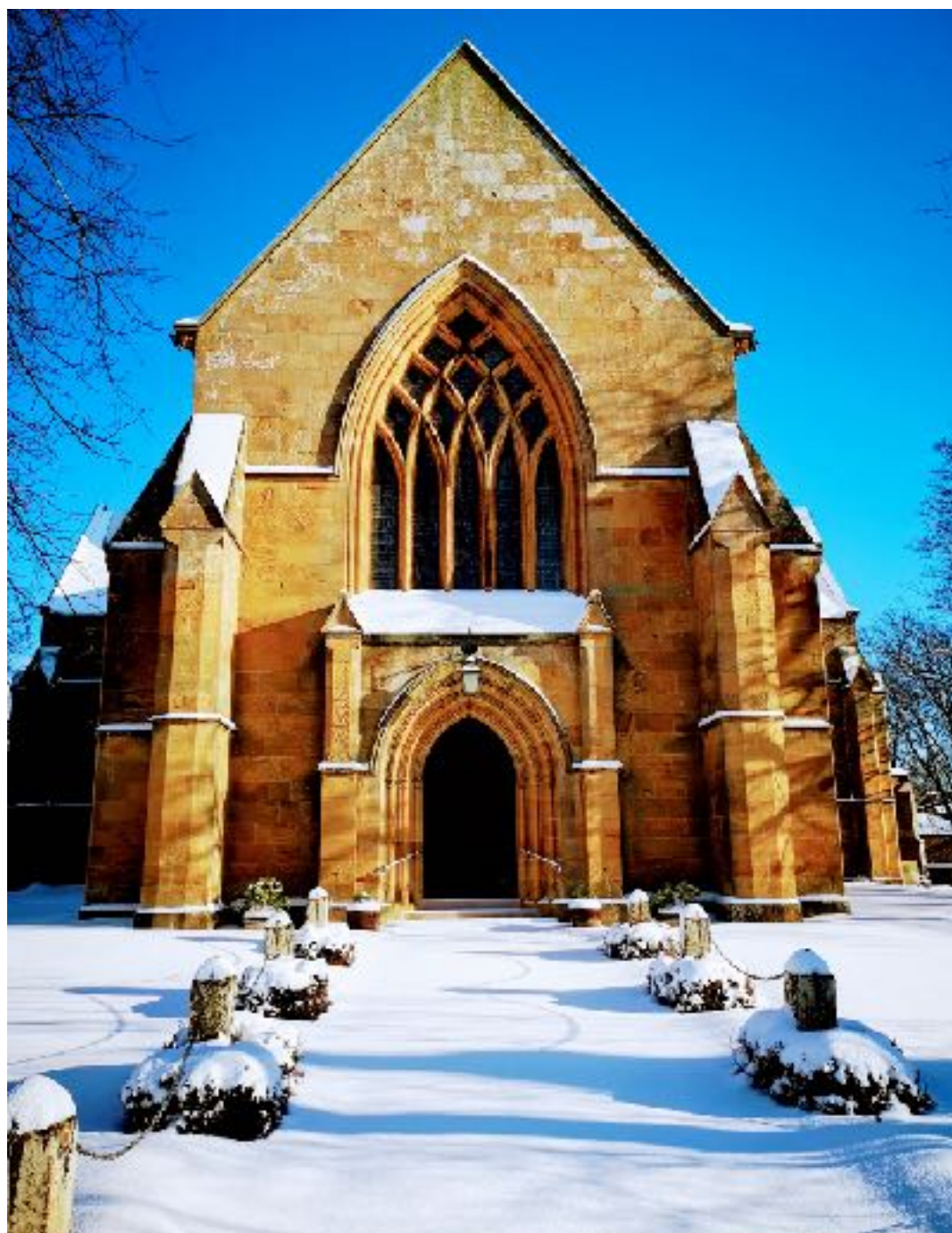
Dornoch Cathedral in the snow