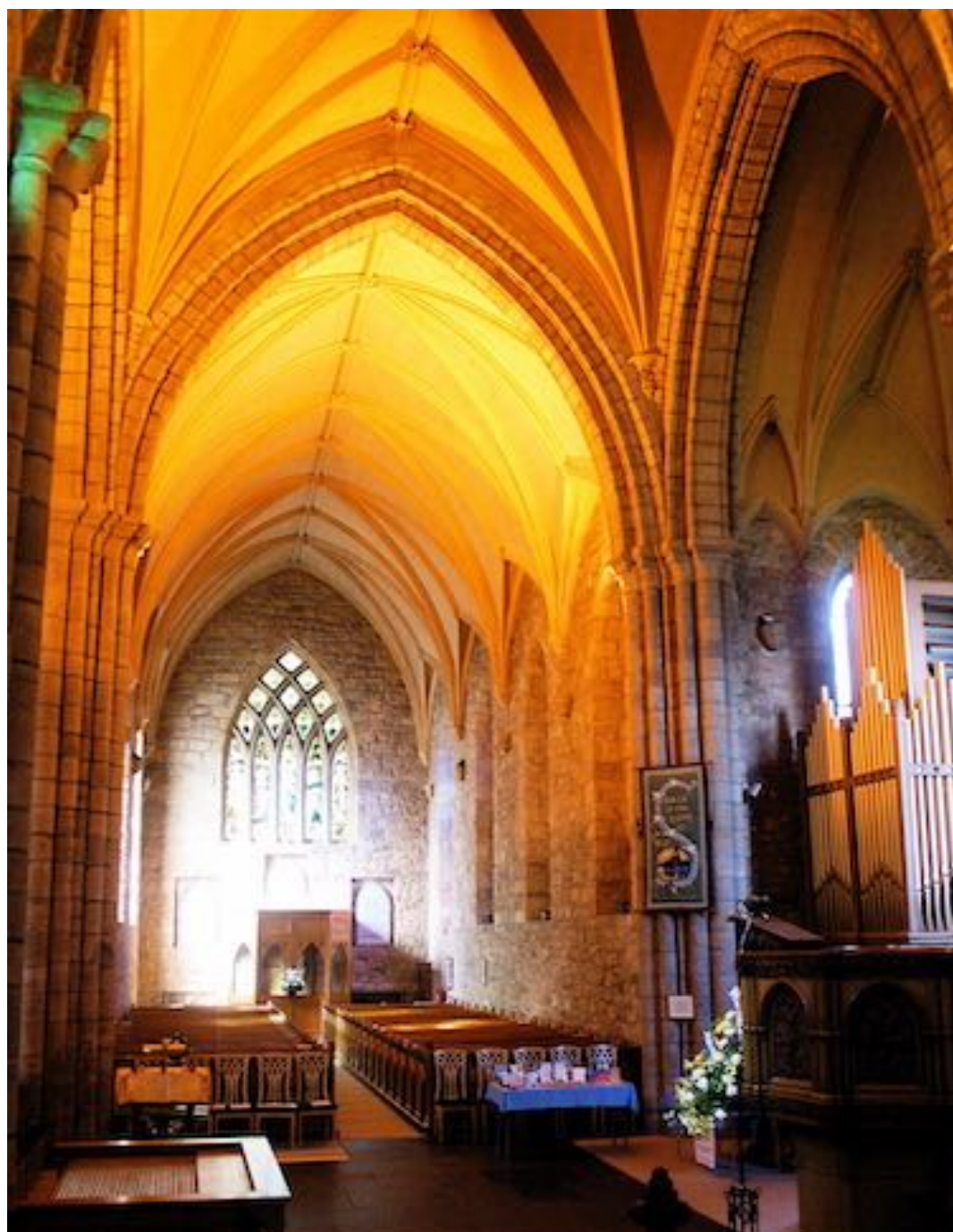
The west aisle of the Cathedral