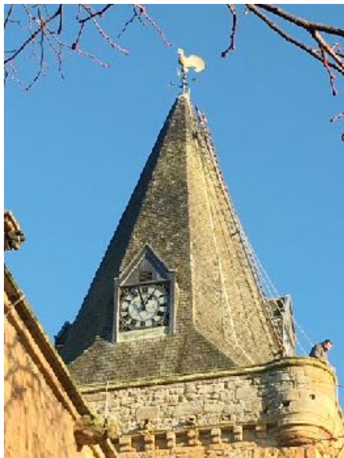
Steeplejacks hoisting materials from ground level due to the narrow twisting staircase.

The Club arranged for their forestry and estate team to clear around all the tree roots and take away all the cut wood leaving our grounds in much better condition.