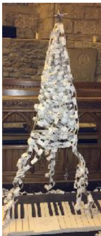
The Cathedral Choir