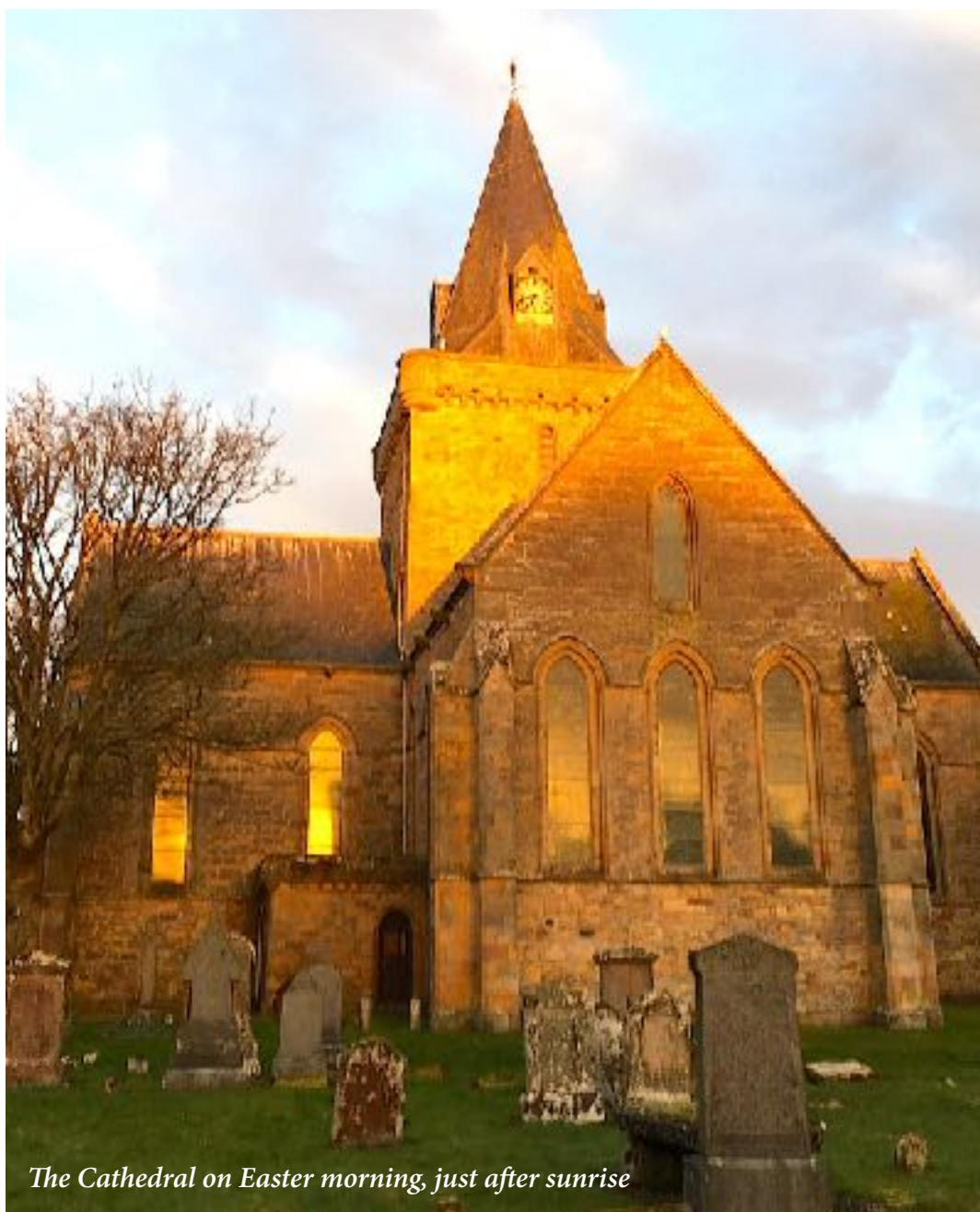
The Cathedral on Easter morning, just after sunrise