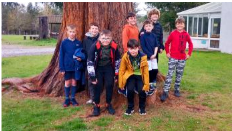
Bbs enjoying their Away Weekend to Nethybridge

Our Annual Prizegiving will take place at 7pm on the 18th of June at the "Songs at 7" in the Cathedral. The boys themselves will lead this Service and we would be delighted if you would join us that evening.