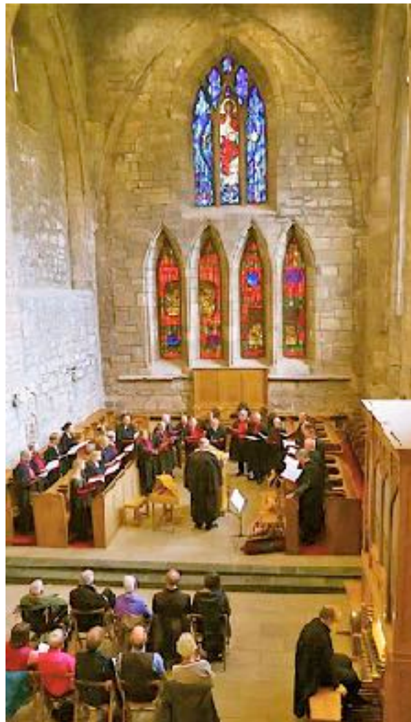
Musick Fyne singing in Pluscarden Abbey

Admission programmes for their concert on June 8th are on sale at the door for £10 in aid of the Cathedral and The Highland Hospice.