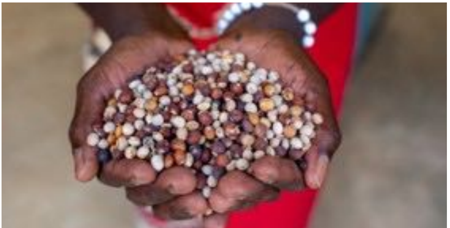
Pigeon Pea seeds