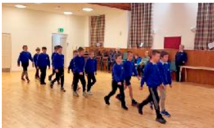
Bbs Marching in West Church Hall

After Easter we started our outdoor programme. Both the Anchor Boys and Junior Section boys have had a walk under Dornoch Bridge and games on the beach. We look forward to craft nights, cycle runs and barbecues before we finish for the summer in June.