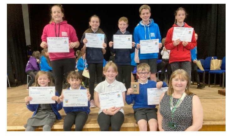
P1, 2 and 3 awards