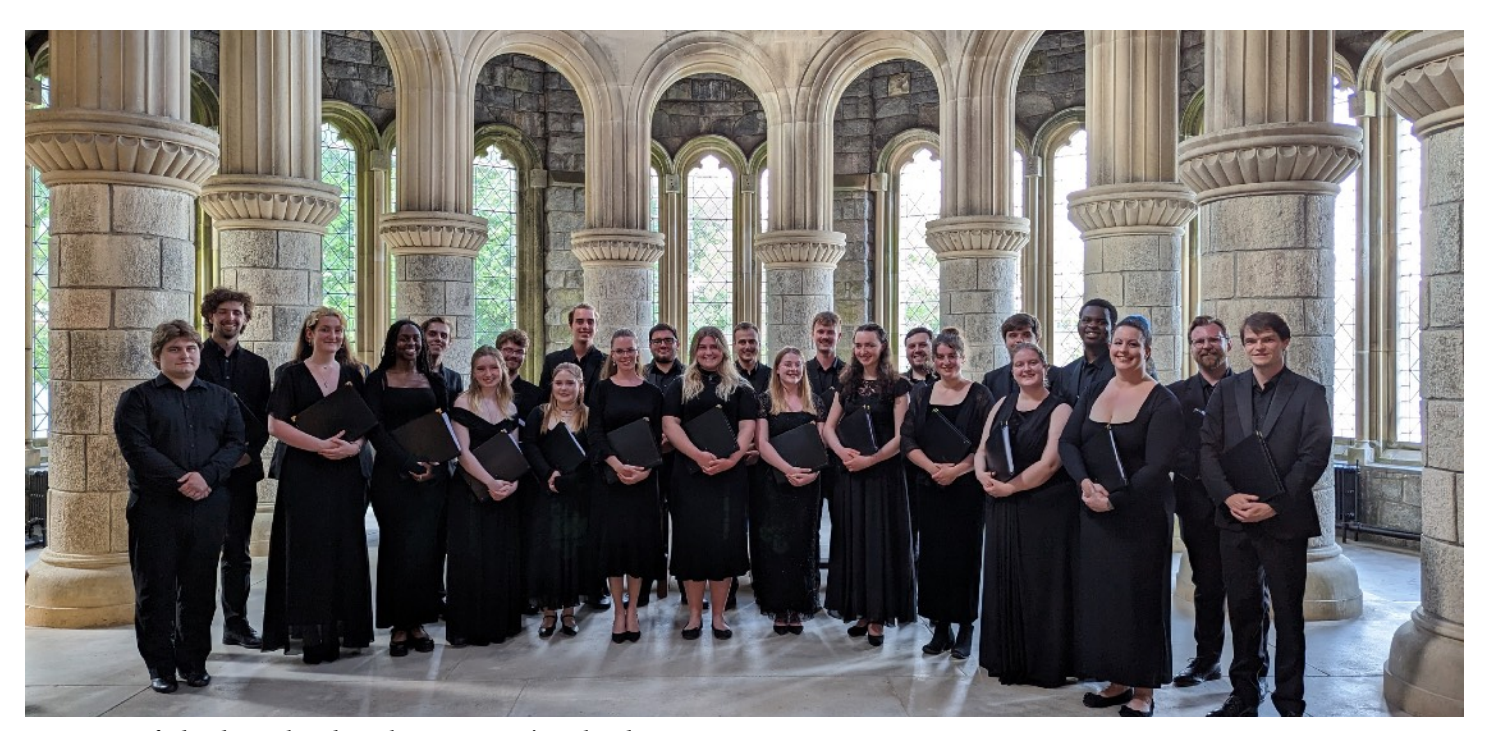
University of Aberdeen Chamber Choir St Conan's Kirk, Oban