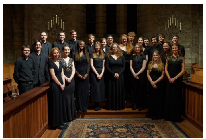
Aberdeen Chamber Choir at St John's Cathedral, Oban.

While the programme has yet to be announced, they promise a memorable blend of innovative and passionate choral music and solo items in the wonderful setting of Dornoch Cathedral.