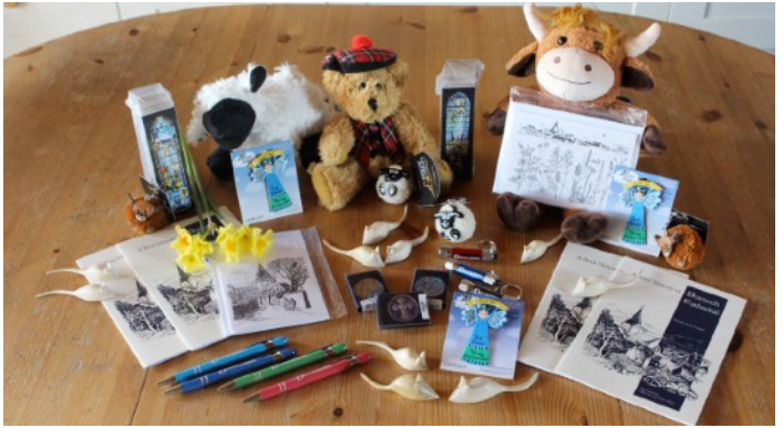
A small sample of items for sale