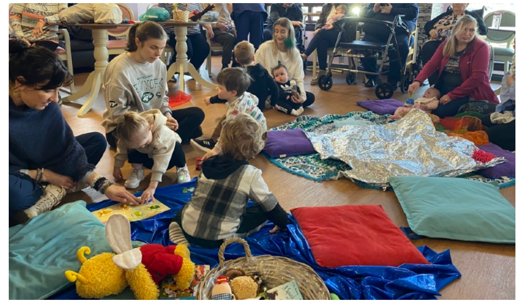
Meadows Care Home visit