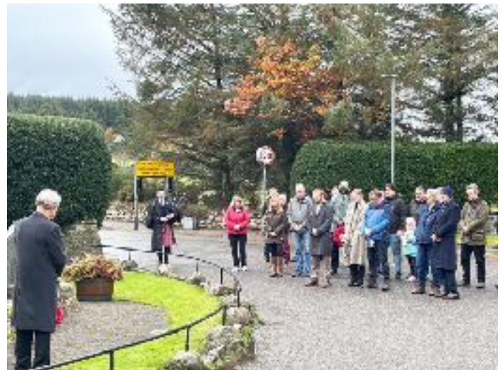
Service at Edderton War Memorial