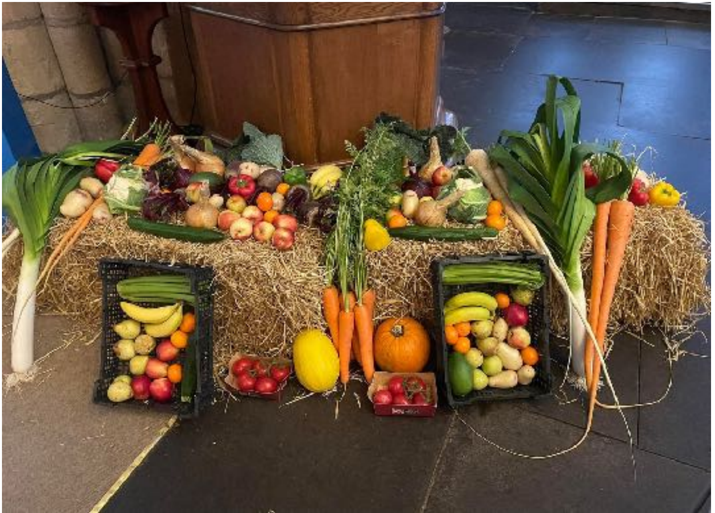
Harvest Service at Dornoch Cathedral

AT THE BEGINNING of October we held our Harvest Services in the Cathedral and An Tobar. The gifts of food and vegetables were distributed to Tain Hub, Ardgay Larder and the Bradbury Centre Foodbank.