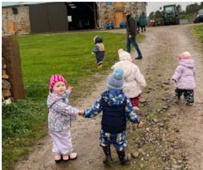
Outdoor learning at Davochfin Farm