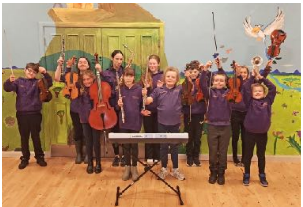
These talented youngster meet on Fridays after school