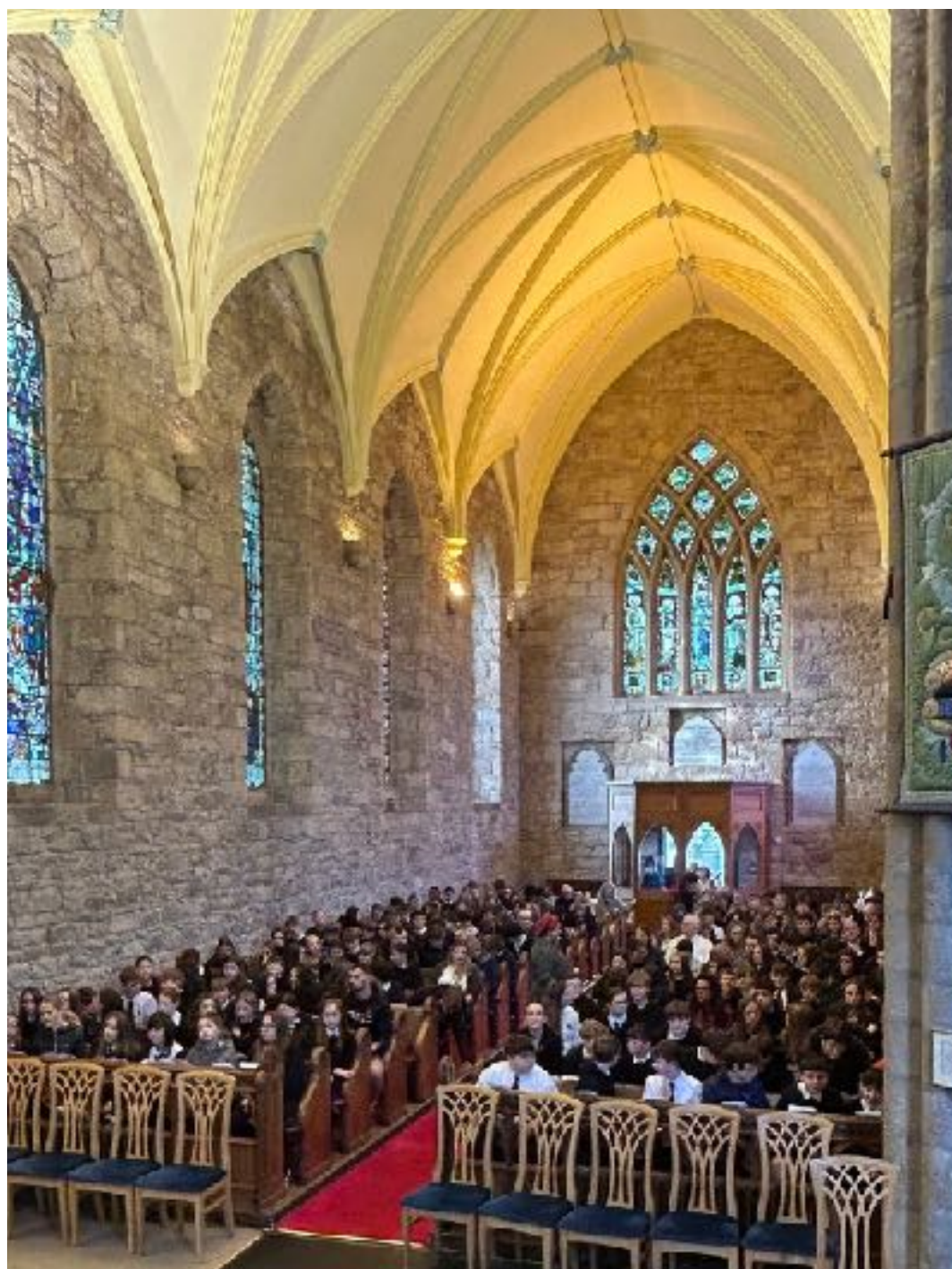
DORNOCH SCHOOL CAMPUS REMEMBRANCE SERVICE