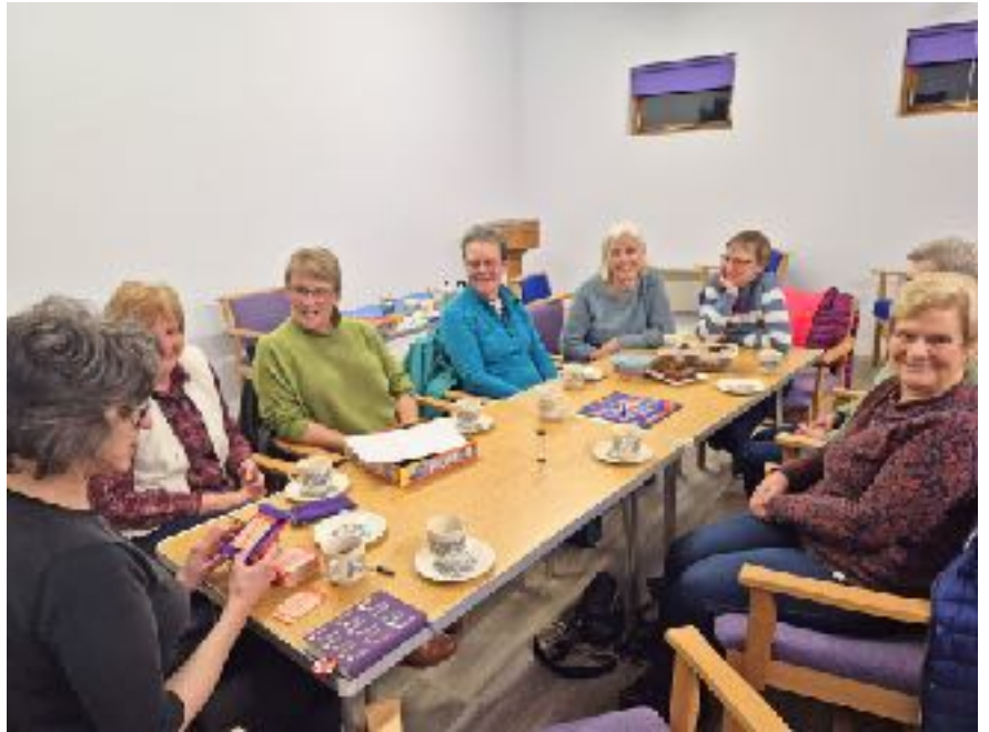
The only TENSION visible is the game box - great FUN Evening