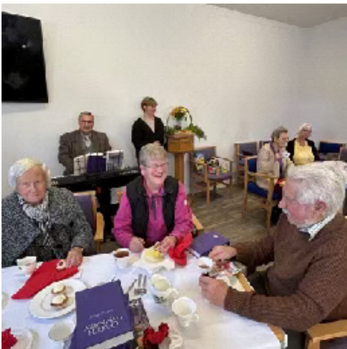
Celebration of harvest at An Tobar with a Soup Lunch