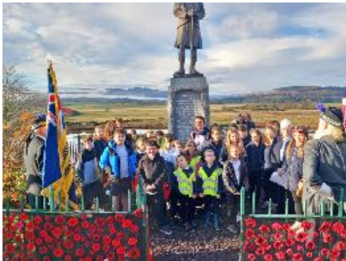
Bonar Bridge Primary School