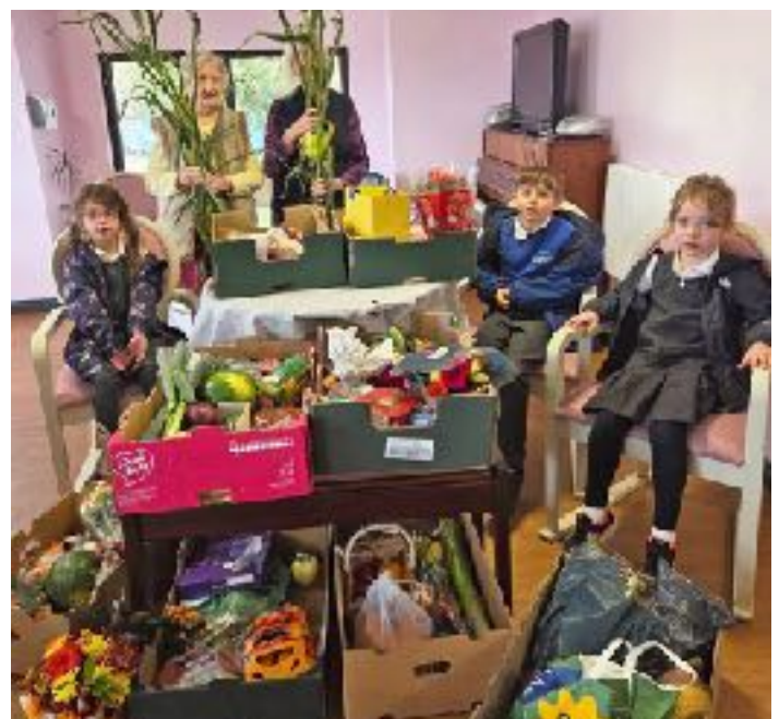
Senior pupils from Dornoch Primary supported the Meadows Care Home