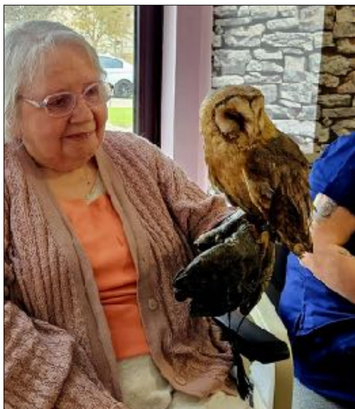
This photo will bring back so many happy memories to many