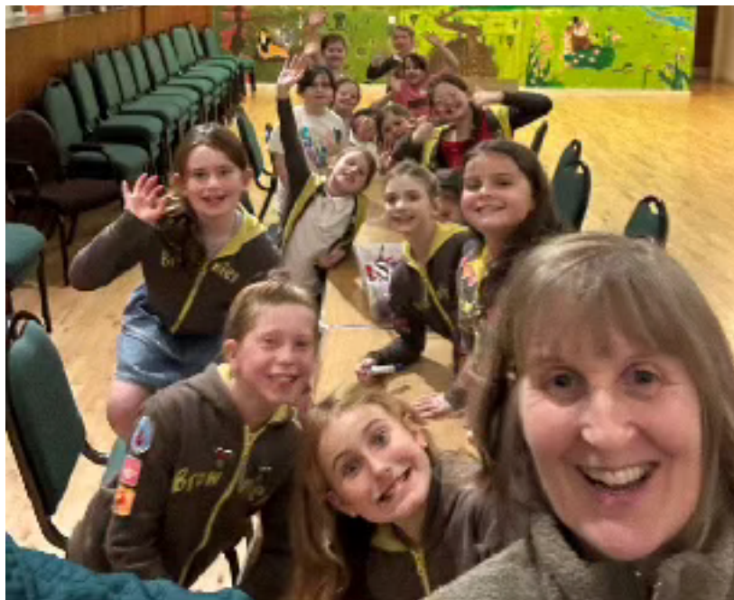
Preparing items for their stall at the Christmas Market