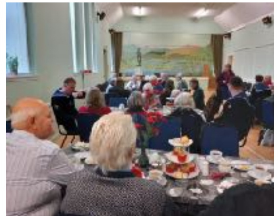
Soup & Sandwich lunch after the Bonar Service