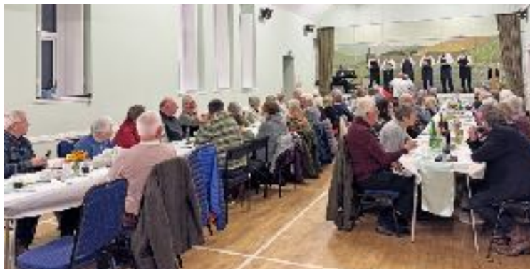
Nearly 80 people enjoyed an excellent meal and entertainment