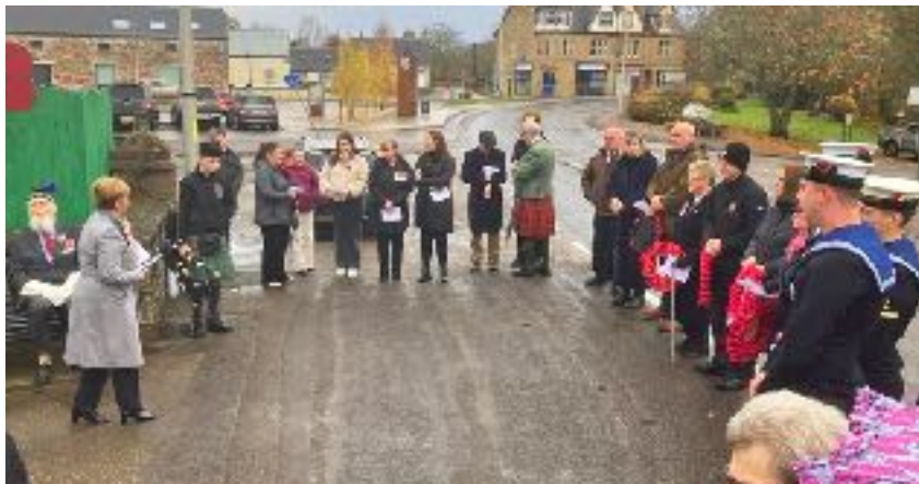
Service at Ardgay

ON SUNDAY 9th November people from villages throughout the Dornoch Firth Parish gathered to remember those that gave the ultimate sacrifice for their country.