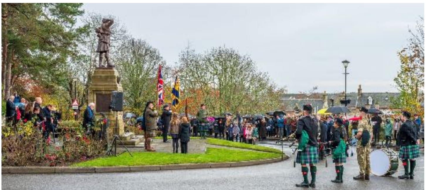
Service at Dornoch War Memorial